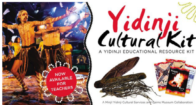
Yidinji Cultural Kit Hire a trunk to use in the classroom Developed in collaboration with Minjil Yidinji Cultural Services. Curriculum links to the HASS Learning Area.