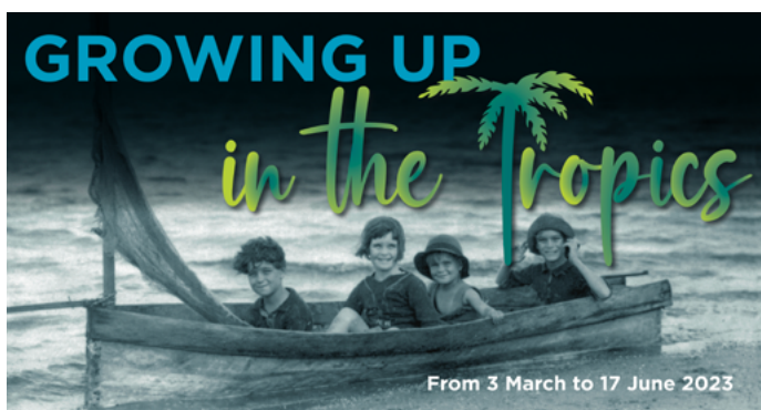
Growing up in the Tropics temporary exhibition 3 March to 17 June 2023 Explore playing, learning, getting around, and resilience from growing up in the Tropics.

The Cairns Historical Society and Museum offers a snapshot of our fascinating, beautiful, and dynamic frontier region and its people. We hold an incredible collection of secrets and memories of the people, places, events, and changing environment of Far North Queensland. Our museum offers a range of activities, displays, and educational options for children from kindergarten through Year 12 and beyond.