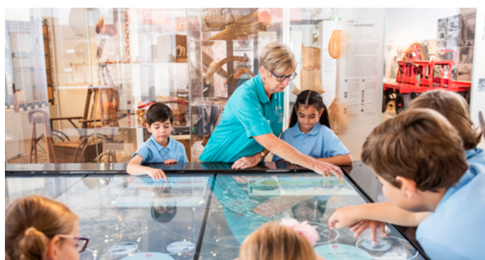
Five air-conditioned galleries Explore Cairns past, present and future Spark imagination and creativity with interactive displays, learn the history of Cairns and what shapes us today.