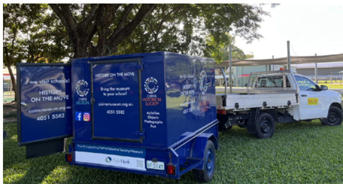
Ports North History on the Move Trailer School Incursions, all ages The museum comes to you! Hands on and interactive learning for students. Sponsored by Ports North.